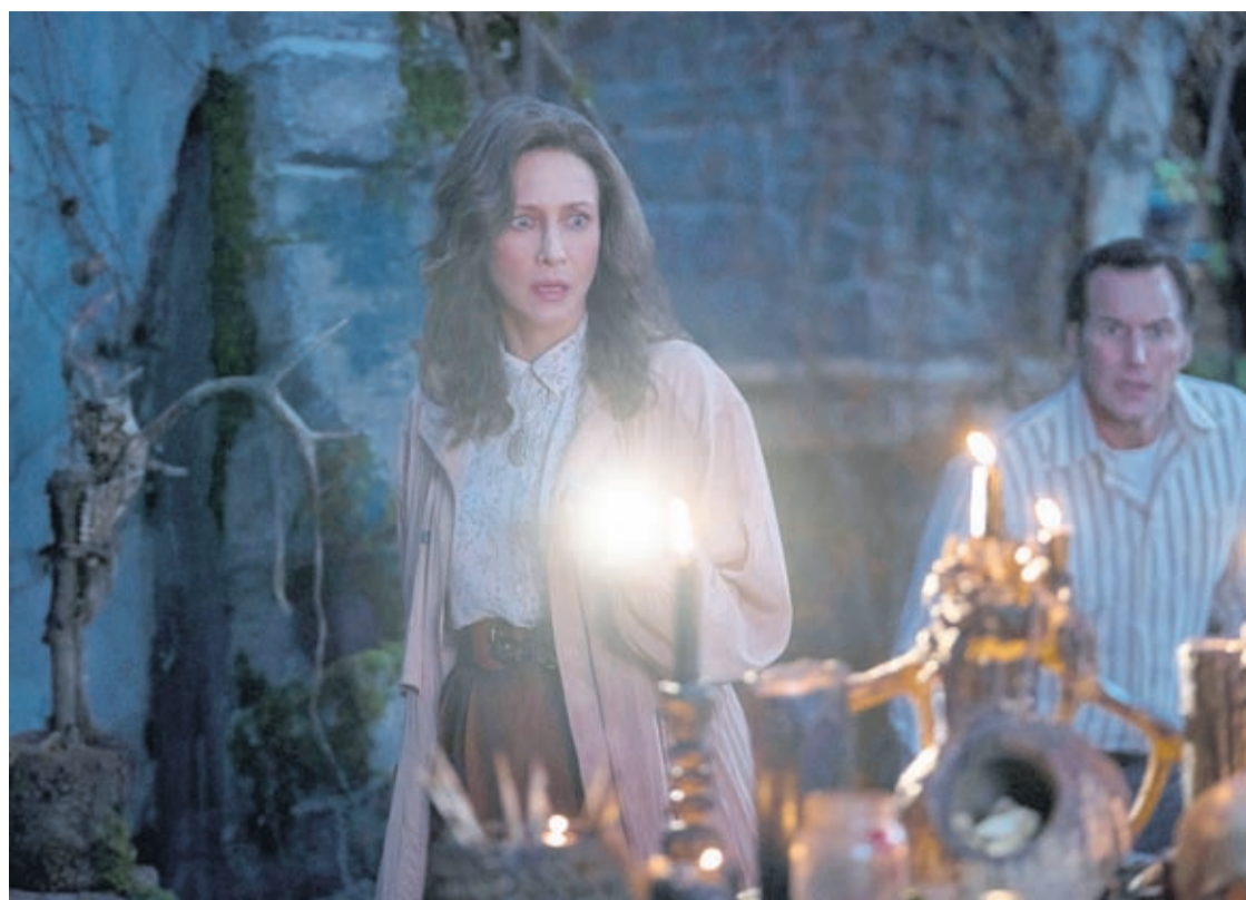
This image released by Warner Bros. Entertainment shows Vera Farmiga, left, and Patrick Wilson in a scene from "The Conjuring: The Devil Made Me Do It."